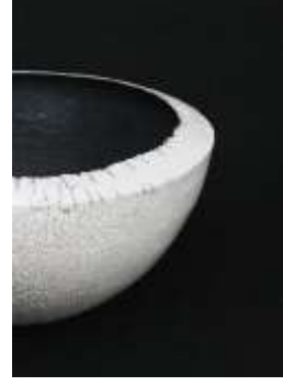
Yang (détail), 2018

of art: the fusion of artistic and gastronomic creation in a very mythic location, rich in history and art, the Villa Ephrussi de Rothschild. This exclusive evening not only allows you to discover the artists' work, but also how it was created through an uninhibited presentation and a frank and dynamic exchange. All in a musical atmosphere, with the sound of a Jazz trio during the cocktail and a gastronomic Dinner of One Thousand Lights.