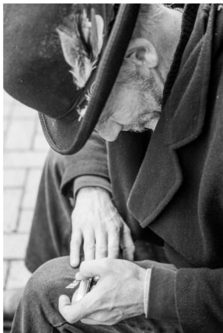
Hutt Street