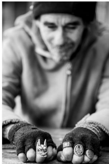
Whitmore Square

Saturday, 21 st January 2017 at 19h | soirée exclusive at the Place de Mougins