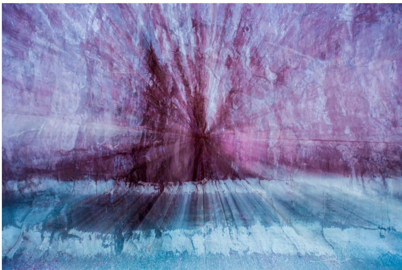
Then and Now, Vallée des Merveilles, France, 2016